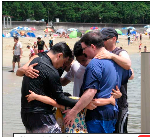
Left: Men's faith huddle - the two pastors and four baptismees join in prayer.