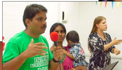
Only at OIC! Left: At a "Filipino & Friends Party", an Indian family shares a passionate testimony of faith, interpreted by an American into Japanese sign language!