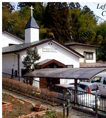
Left & steeple/roof below: Bethel Mission Christ Church. This tiny congregation continues in faith above the city.

Left: Volunteers from CRASH and Tono City work together to make riceballs for people in the emergency shelters. Today's goal: 1,700 riceballs by 2:00 pm.