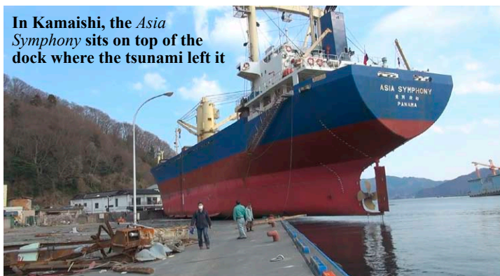
In Kamaishi, the Asia Symphony sits on top of the dock where the tsunami left it