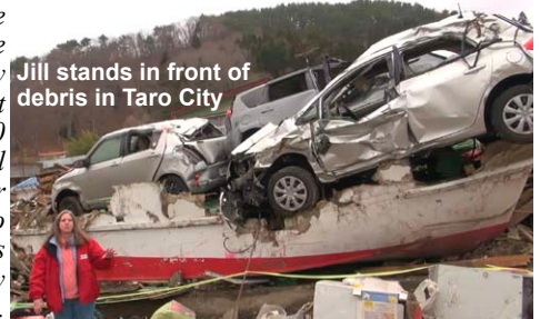
Jill stands in front of debris in Taro City

At Taro, the shape of the coastline squeezed the tsunami into a narrow channel where the height of the wave reached 130 feet, the highest level recorded. Jill, a volunteer from the U.S. who grew up in Japan, was heartbroken when she saw the destruction of Taro.