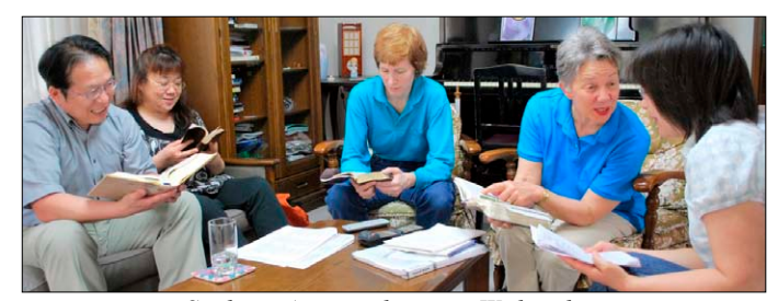
Studying Acts in a home on Wednesdays

The small group ministry continues to have a big impact. Many new decisions for Christ happen in the small groups, perhaps because it is easy to ask questions and make friends. Currently, 13 OIC small groups are meeting, plus three cell church small groups - add in three worship services and two prayer meetings, and there are 21 groups meeting at eight locations. This gives even busy people a chance to find something that fits their schedule. Praise the Lord!