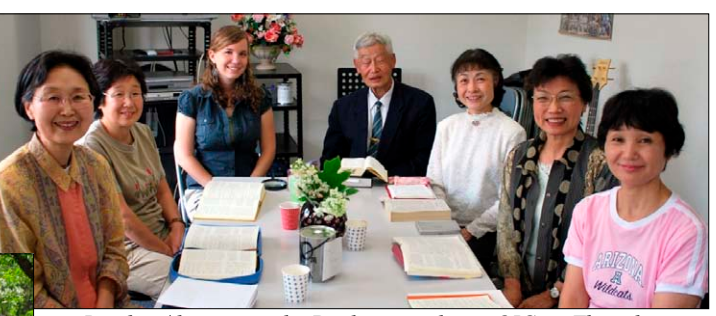
Reading/discussing the Pauline epistles at OIC on Thursdays