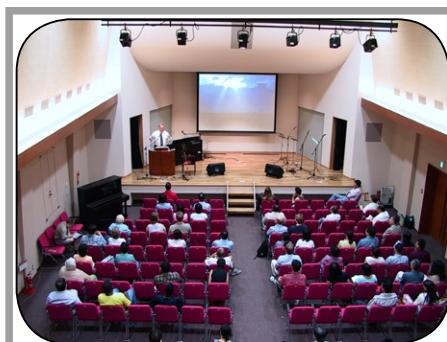
The hall in the new building of the Osaka Christian Center, where we now have Sunday worship (only part of the seating is visible in this photo). Pray for more people to fill the 300 seats!

Pray that we would not let all the "doing" distract us from "being" with Jesus – spending intimate time with Him!